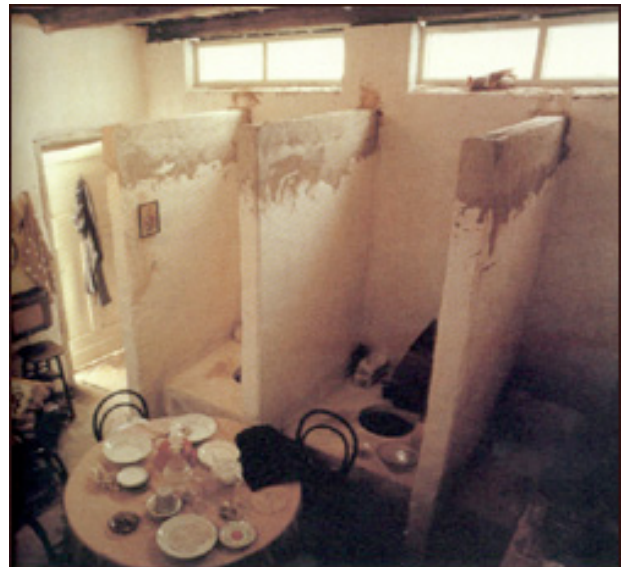
Кабакон, Туалет (1992)

This seminar will emphasize discussion and student participation. Throughout the semester, students will be asked to present on the different art movements (avant-garde, socialist realism, post-sots) of the twentieth century, in order to place our readings in context. These will be group presentations and may take any form and focus on any topic related to the specific artistic movement (for example, Kazimir Malevich and the avant-garde, socialist realist sculpture, conceptualist poetry, etc.) Students are expected to participate actively in class discussion and to attend all seminars unless ill. Film screenings will take place on Mondays, 6-8pm in G-17 FLB, and the films will also be placed on reserve at the Undergraduate Library. Since most of these films are not available via other sources and require a multi-standard multi-region dvd player, students are encouraged to attend the Monday screenings to the best of their abilities.